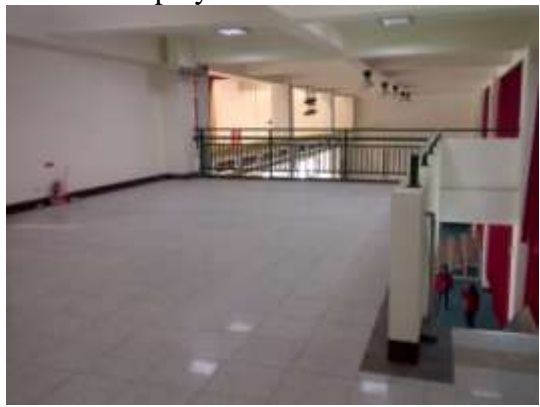
TD and referee office space, playing area to the left

Offices (TD, referees): available on a mezzanine level up steps overlooking the field of play