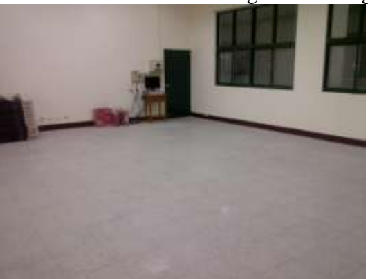
Floor non-slippery, not carpet

Room size: approximately 5m x 5m on the ground floor with sufficient space but consideration should be given to using a table in the training area