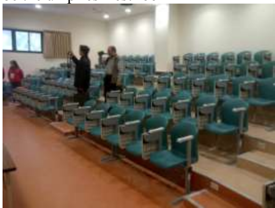
Technical meeting and umpires' rest area

Call area ("rule 51"): available behind the pillars on the competition floor Meeting room: is available on the ground floor theatre style with a projector for the technical meeting (draws to be done in the hotel). This will likely also be the umpires' rest room