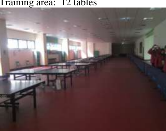
Training area (lighting not switched on)