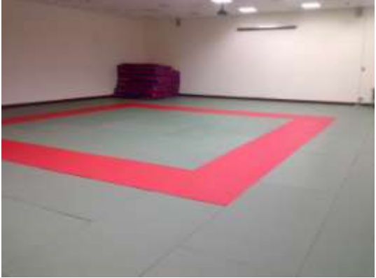
Athletes' rest area

Rest areas (umpires, players): both are available but the players' rest room will need a small ramp installed