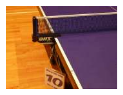
DHS P104/106, ITTF approved