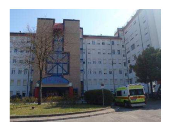
Hotel Vila Mare

Accomodation : All players and officials were staying at Villagio Turistico Sportivo EFA-GETUR in hotels Sole Mare, Erica, Primavera, Santa Maria and was good and very close to the venue. The hotels are full accesable for wheelchair players.