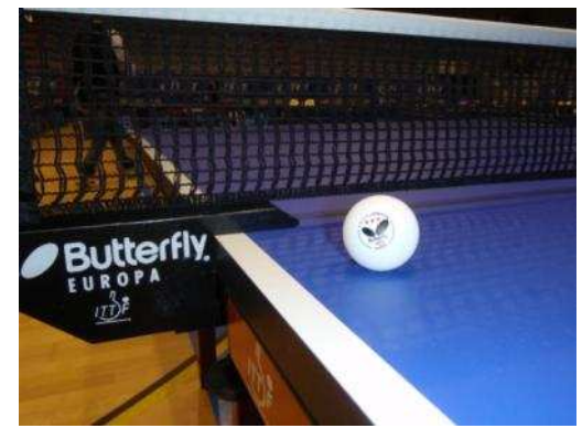
Butterfly net and ***ball white