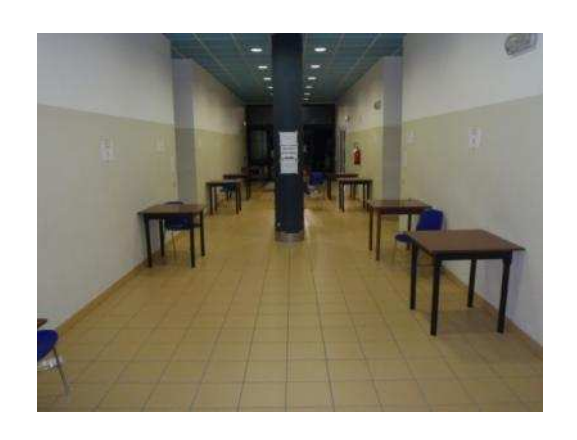
Room 51: Milana Krmelj SVN

- Romania 1, Belgium 2, Czech 4, Slovenia 2, Philliphines 1, Croatia 3, Austria 1, Slovakia 4, Italy 24