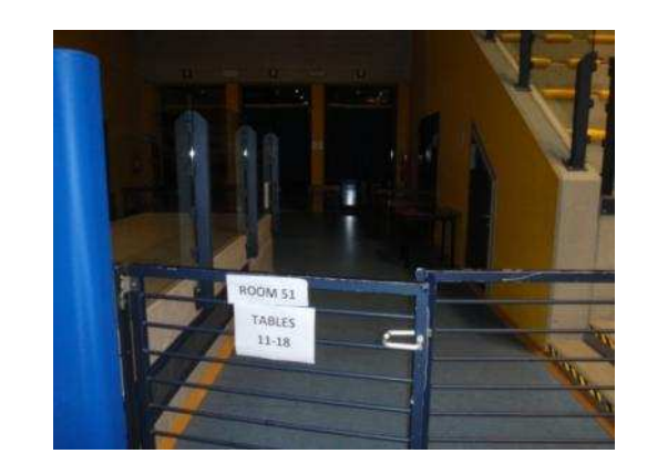
Room 51 2nd Room 51