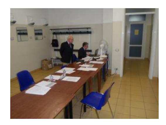
Racket control room

Ball boys/girls: Every day approximatly 100 ball children were at the venue from three different schools nearby. They worked very good.