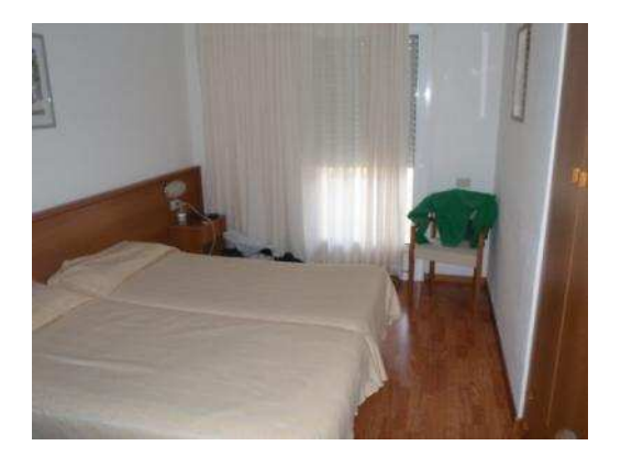
Room in one of the hotels