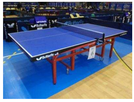
Butterfly centrefold 25(blue)