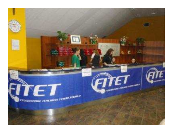
Pigion boxes, water supplies

Meals : All meals served at the hotel and was good quality. Water was provided for everybody in the venue.