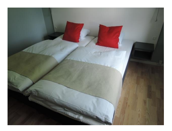
Room in Haraldskjear