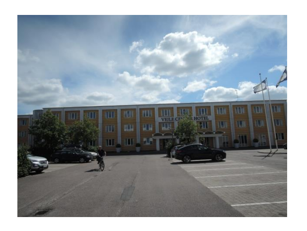
Vejle Center hotel