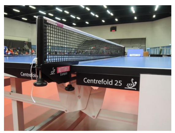
Table and net