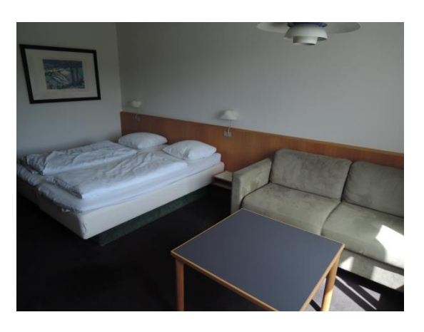
Room in Vejle center