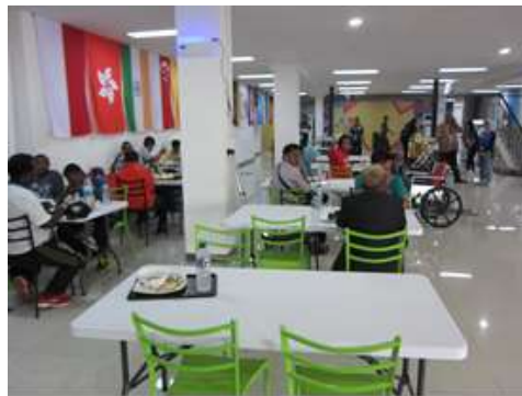
Athletes' Dining Area