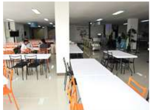
NTOs and others Dining Area