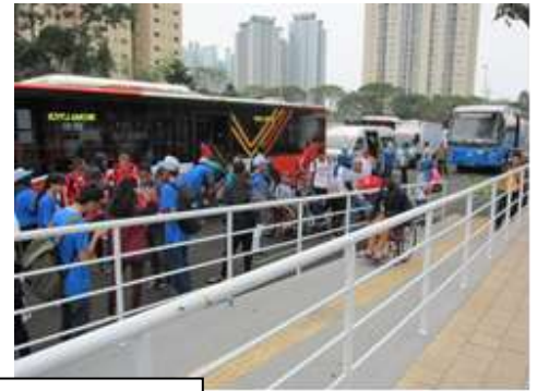
Transport at the Village