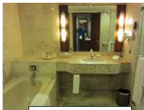
Attached Bathroom cum Toilet