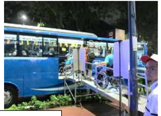
Transport at the Venue