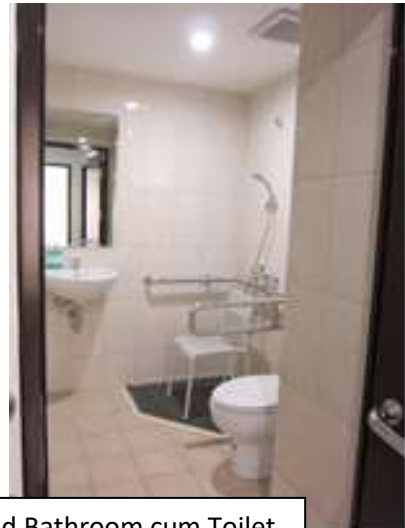
Accessible Attached Bathroom cum Toilet