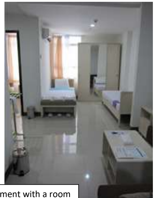
Accessible Apartment with a room with 2 single beds and a room with one single bed